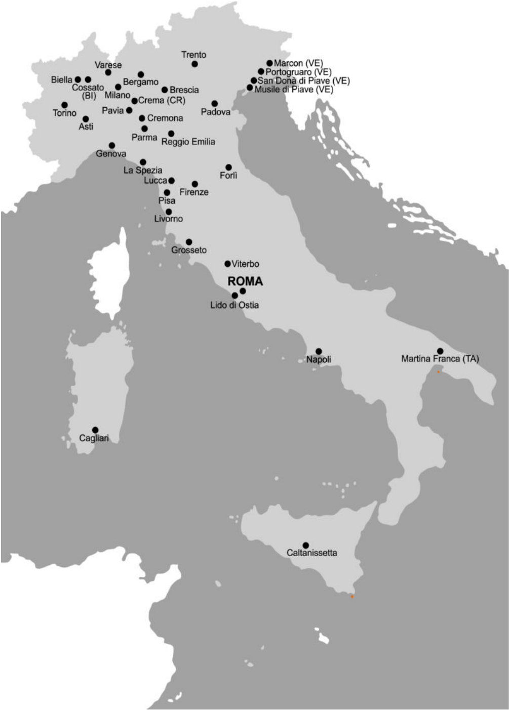
Fig. 1: Map with Italian cities where an urban Atlas was organized.